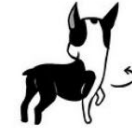
"RESPECT!" turn & walk away