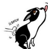
"I LOVE YOU, DON'T STOP"