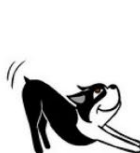
"HELLO I LOVE YOU!" greeting stretch