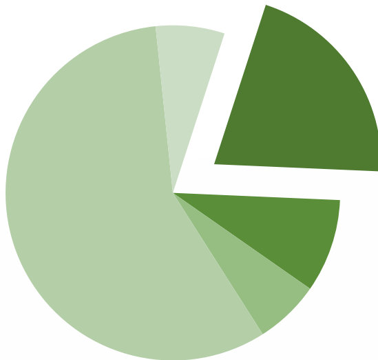
Mobility, Economic Growth & Resiliency Expenditure Budget: $110,469,233

The Department of Development Services promotes a culture where staff and customers work in partnership to create and sustain a better quality of life and environment in which to live, work, and play. Development processes are designed to be effective and efficient, and ensure compliance with federal, state, and local regulations. The Department of Development Services supports economic development, public safety, revitalization, infrastructure improvements, and the protection of natural resources. Staff provides customers with the highest quality of service and respect. The department supplies the public with development information through effective communication and education.