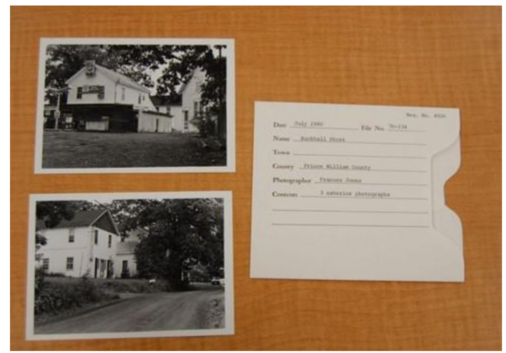
Buckhall Store