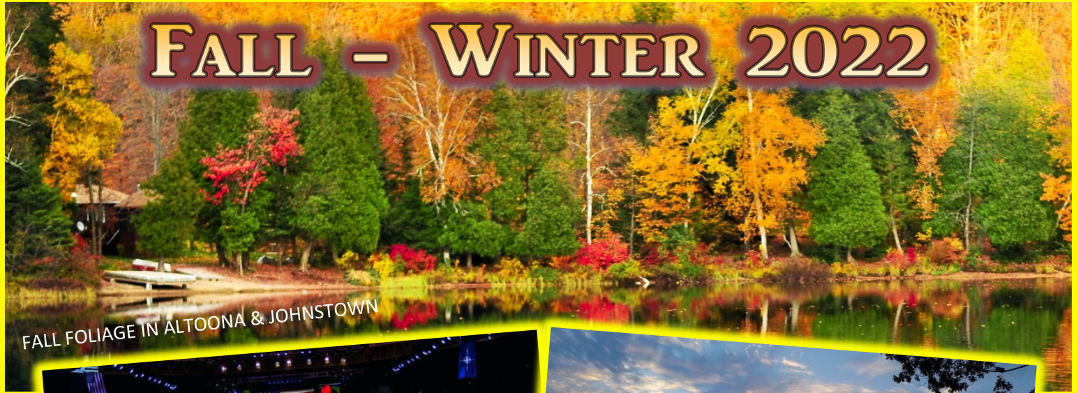
FALL FOLIAGE IN ALTOONA & JOHNSTOWN