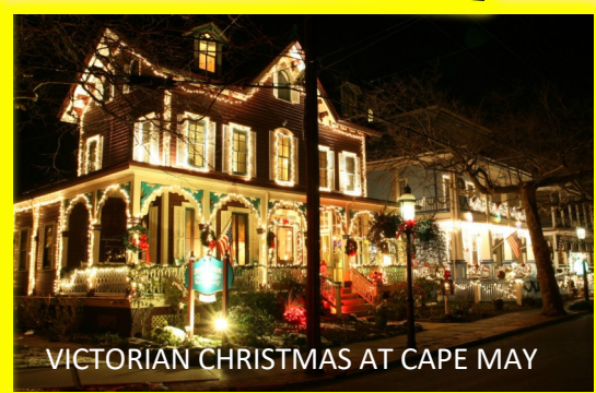
VICTORIAN CHRISTMAS AT CAPE MAY