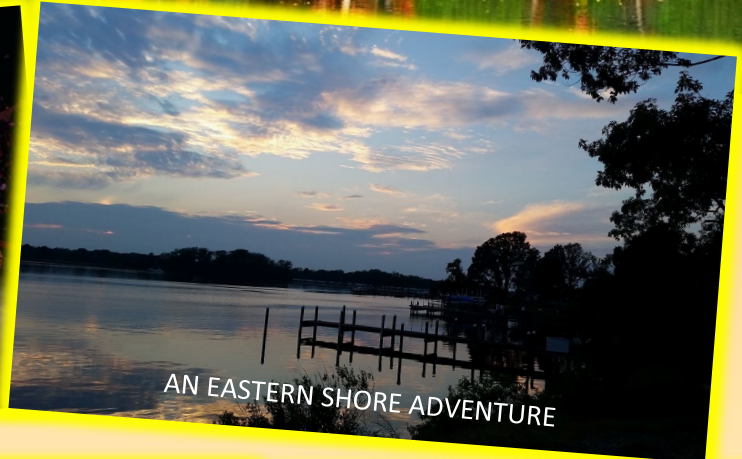
AN EASTERN SHORE ADVENTURE