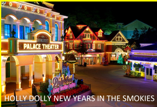
HOLLY DOLLY NEW YEARS IN THE SMOKIES