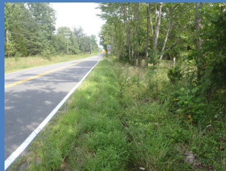
From the west end of the project looking east

On August 19, 2013, the public comment period will close. PWC staff will then review and evaluate all comments received as a result of the citizen information meeting. Once public input has been reviewed, the project will be presented to the PWC Department of Transportation who will consider approval of the project's major design features. Upon approval of the major design features, the project will proceed to the final design phase, and given to VDOT for final approval.