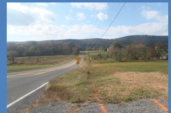
From Meander Creek Lane looking west at Logmill Road