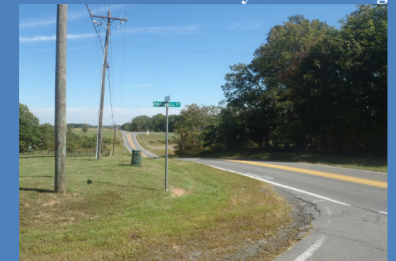
From Parnell Court looking east at Logmill Road

We look forward to working with you as the project moves forward. Thank you for coming!