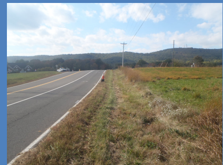
From the east end of the project looking west

Project plans and other information will remain available for review at the PWC Department of Transportation office located in Prince William, Virginia.