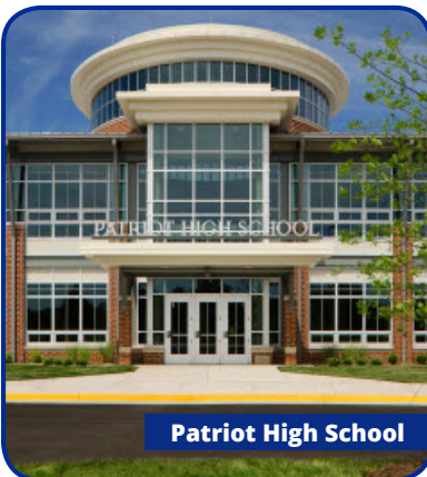
Patriot High School