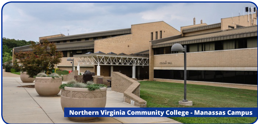
Northern Virginia Community College - Manassas Campus