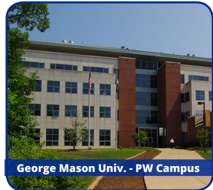
George Mason Univ. - PW Campus