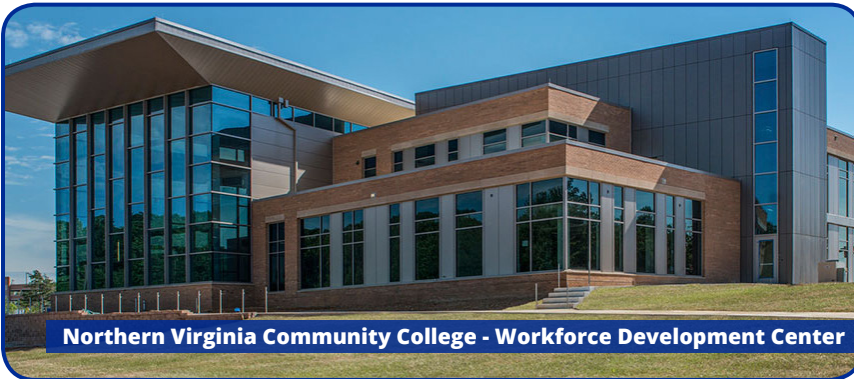
Northern Virginia Community College - Workforce Development Center

Prince William County is home to a variety of public and private educational entities, ranging from preschools to universities. While each of these entities contributes to the Quality Education and Workforce Development goal, the public entities have the most direct ties to the County. Prince William County Schools, Northern Virginia Community College, and George Mason University each have strategic plans that outline their individual goals for the near future. In an effort to maximize the partnerships between the County and these entities, the County's Strategic Plan incorporates outcomes from the various strategic plans that are of most interest to the community at large.