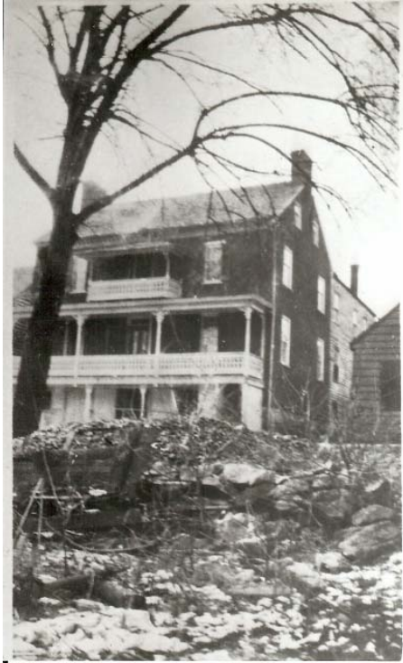
Alton Hotel.

as eleven other stores and houses and “about a hundred frame sheds and barns.” 3 Today, Jerry’s Occoquan Jewelers operates at 306 Mill Street, where the Alton Hotel building stood for more than a century. 4