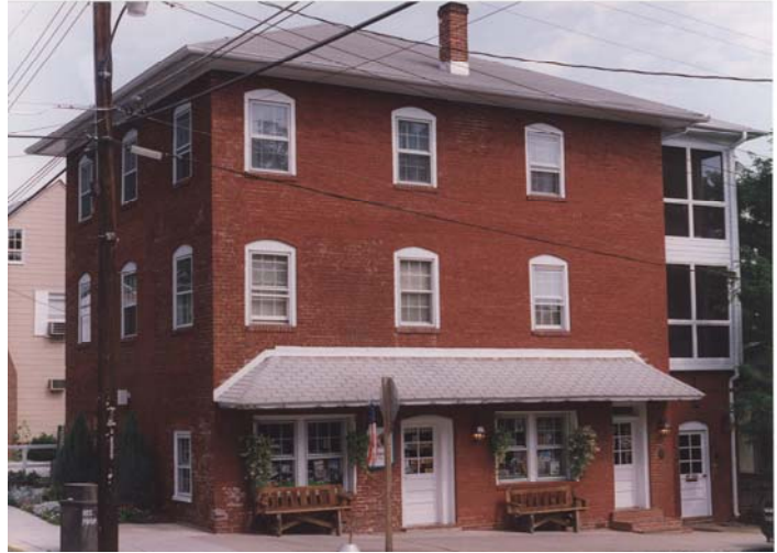
The Hammill Hotel in the 1990s.