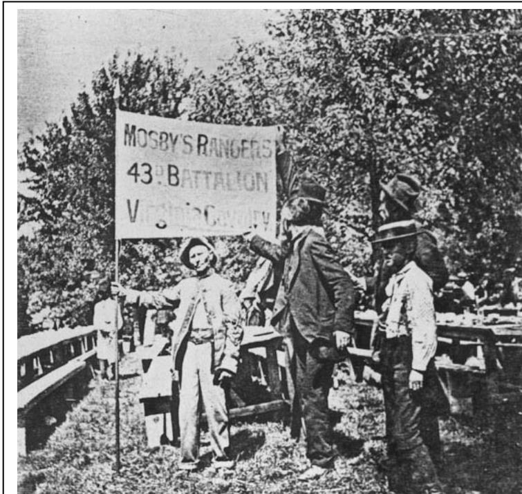
“Former Rangers ready for a reunion,” Mosby Vignettes 1:83.