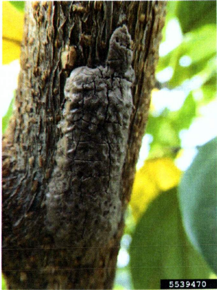
Spotted lanternfly egg mass