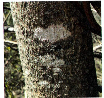
Lichen on bark