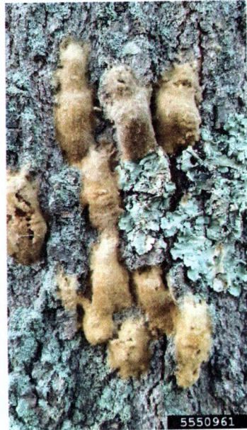
Gypsy moth egg masses are covered with brown hairs.