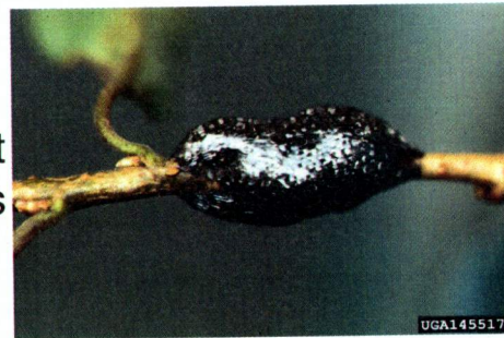
Eastern tent caterpillar eggs