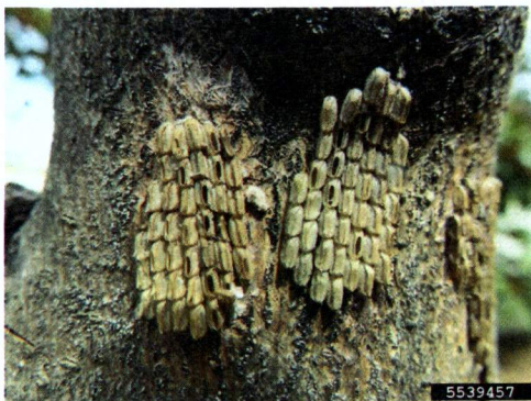
Spotted lanternfly eggs without covering.