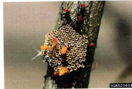
Wheel bug eggs and nymphs